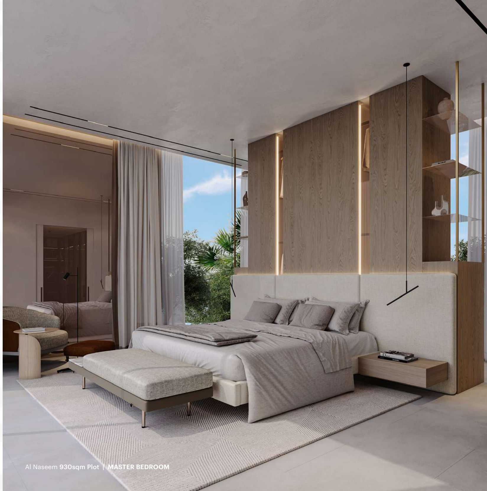
Al Naseem 930sqm Plot | MASTER BEDROOM