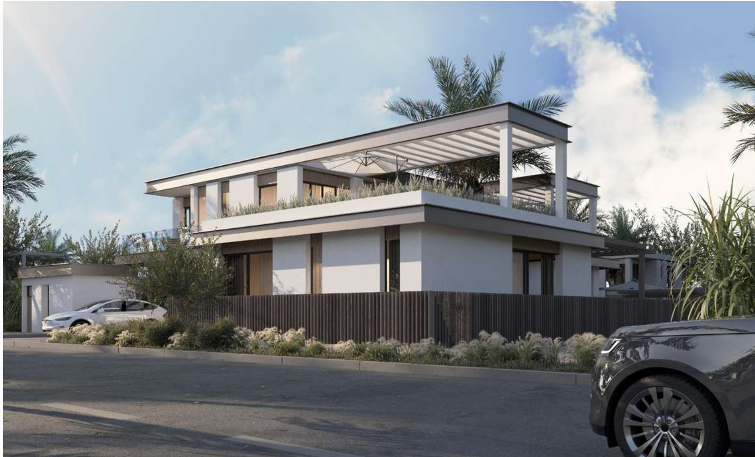
Al Naseem 750m² Plot | FRONT EXTERIOR PERSPECTIVE - STREET VIEW | Modern Contemporary Facade Option