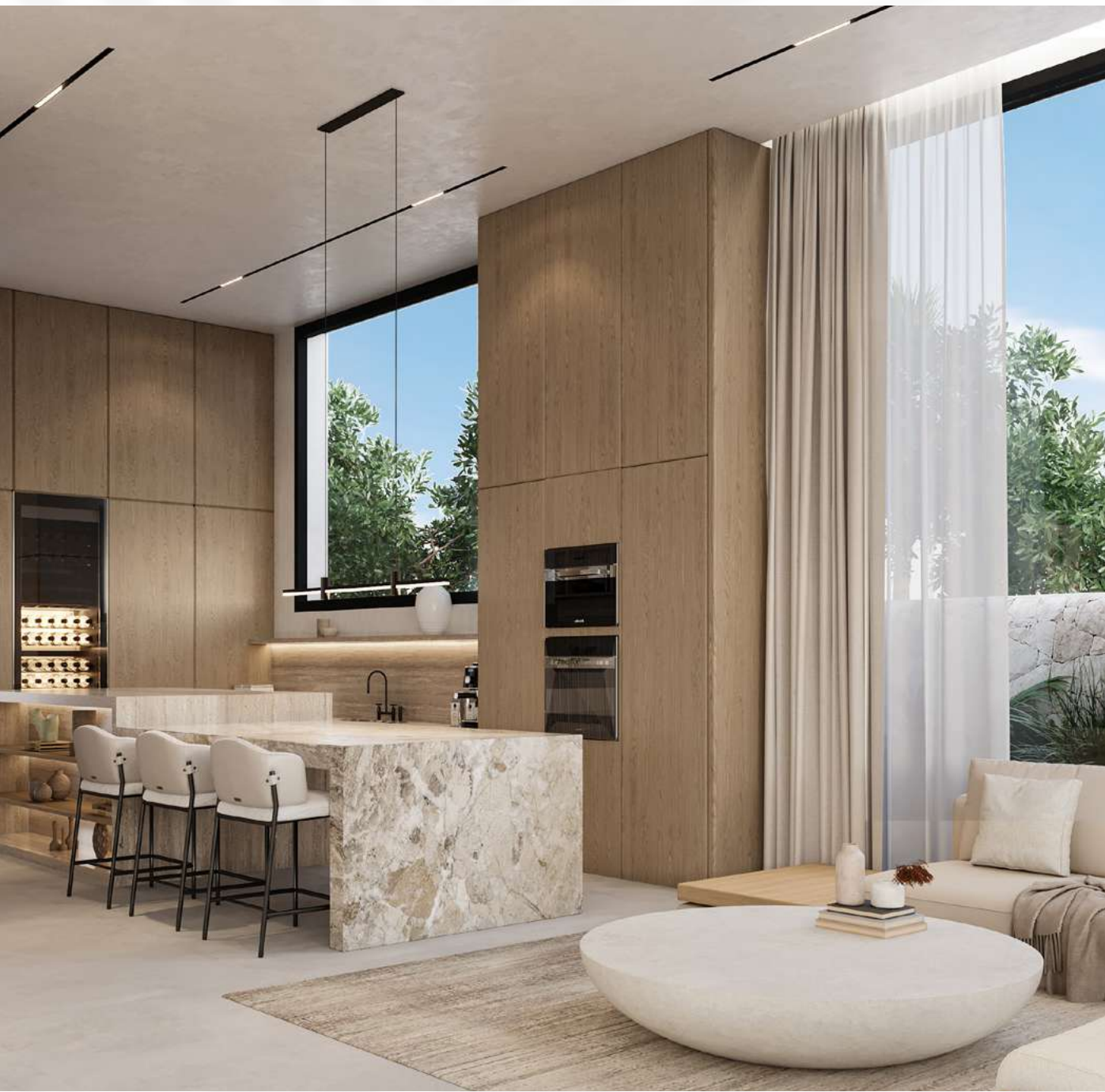
Al Naseem 930sqm Plot | SHOW KITCHEN