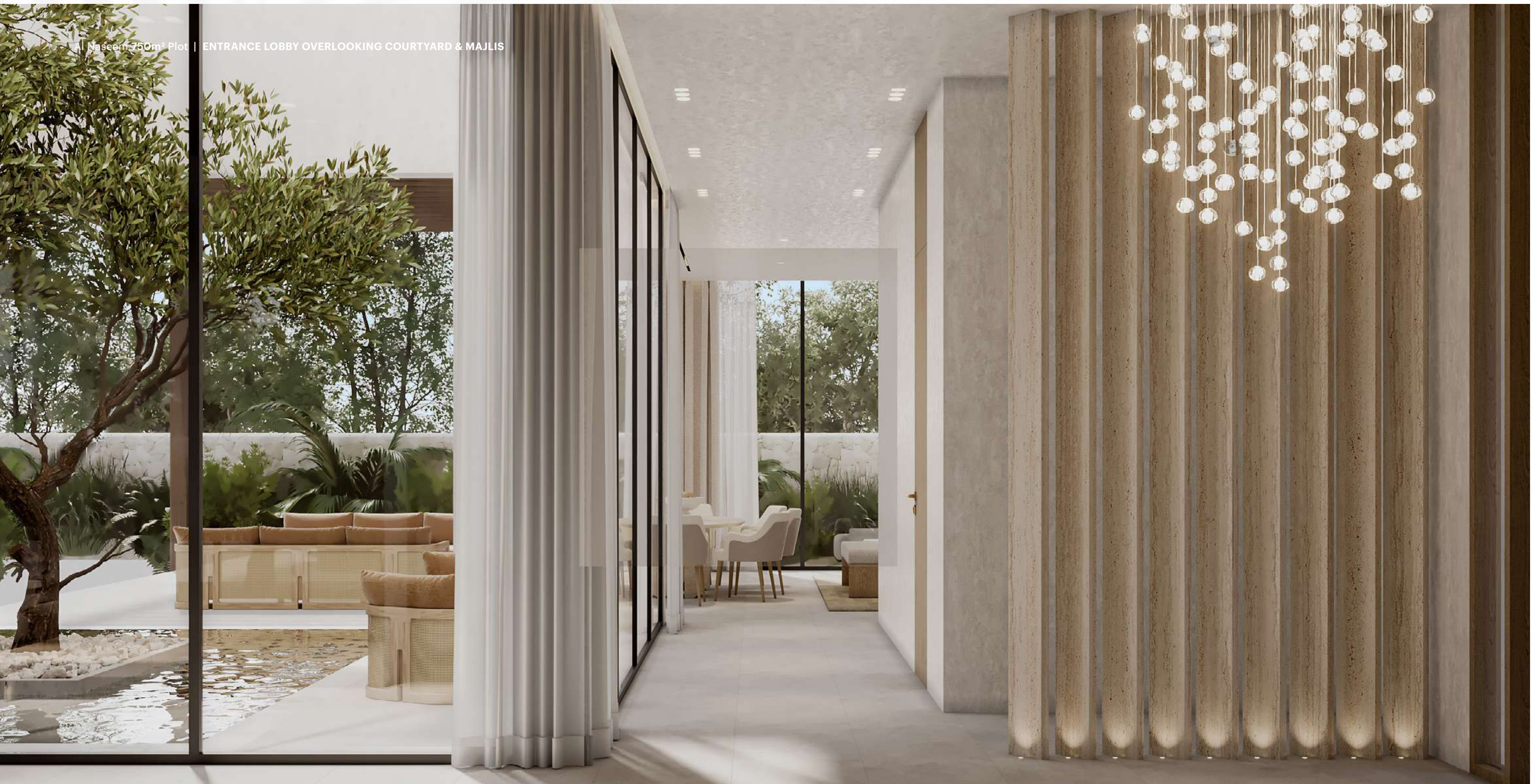
Al Naseem 750m² Plot | ENTRANCE LOBBY OVERLOOKING COURTYARD & MAJLIS