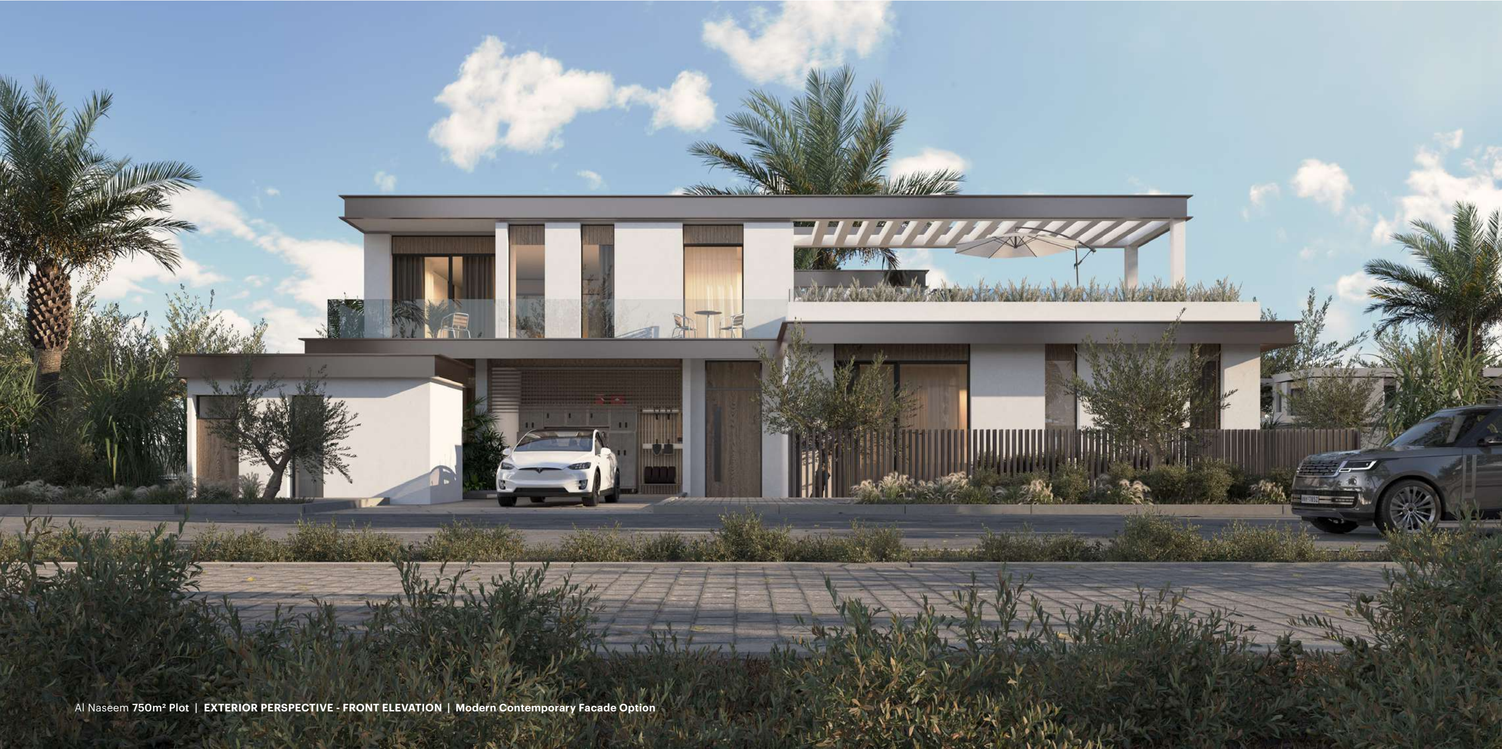
Al Naseem 750m² Plot | EXTERIOR PERSPECTIVE - FRONT ELEVATION | Modern Contemporary Facade Option