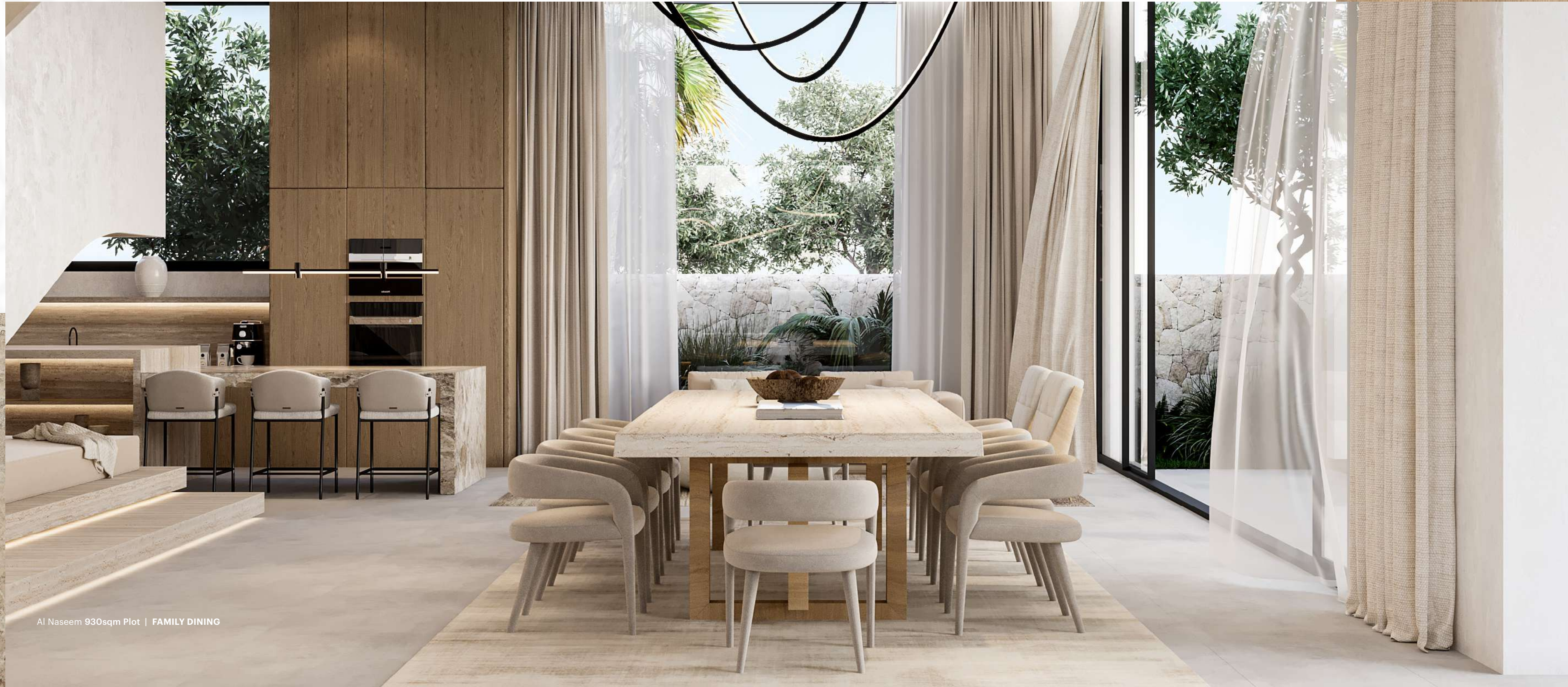
Al Naseem 930sqm Plot | FAMILY DINING