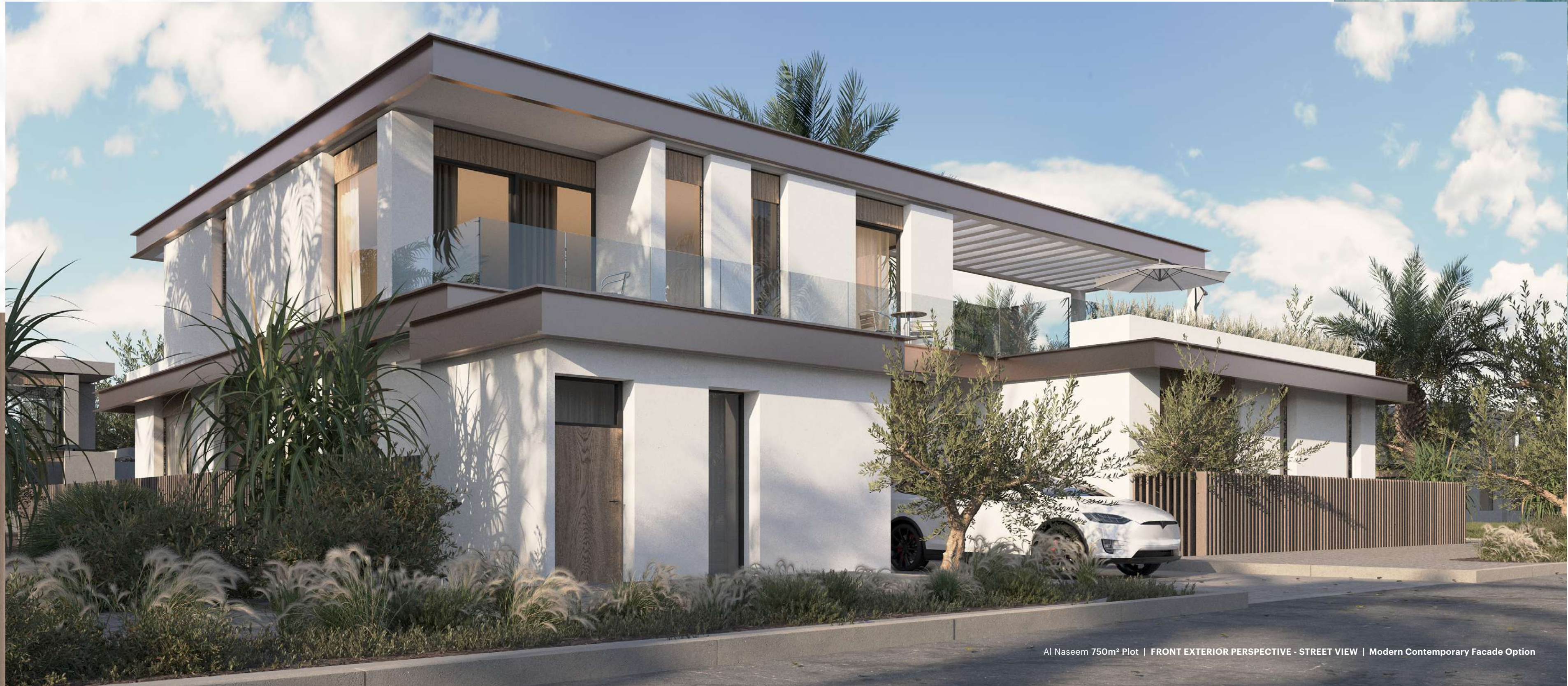
Al Naseem 750m² Plot | FRONT EXTERIOR PERSPECTIVE - STREET VIEW | Modern Contemporary Facade Option