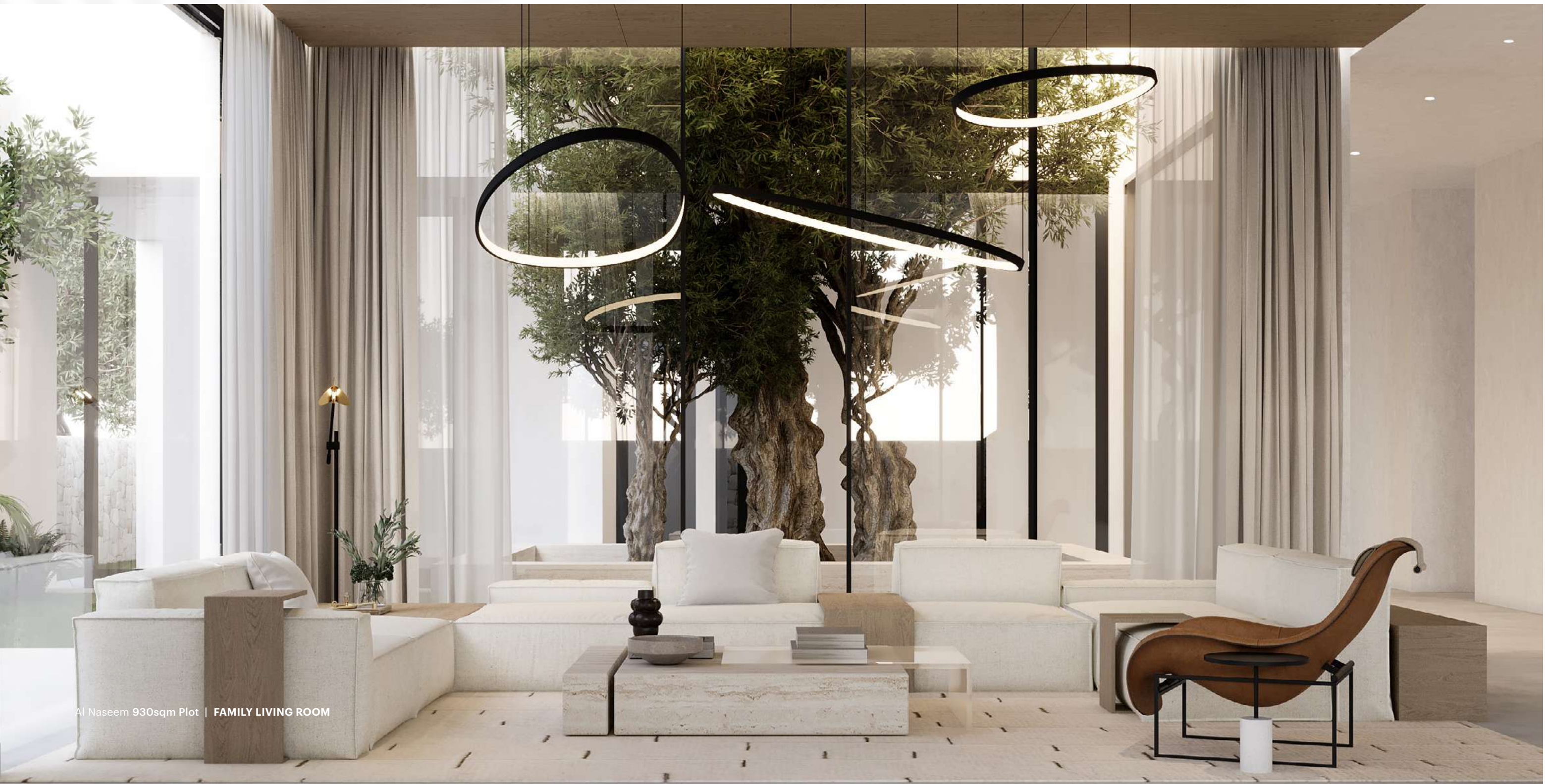
Al Naseem 930sqm Plot | FAMILY LIVING ROOM