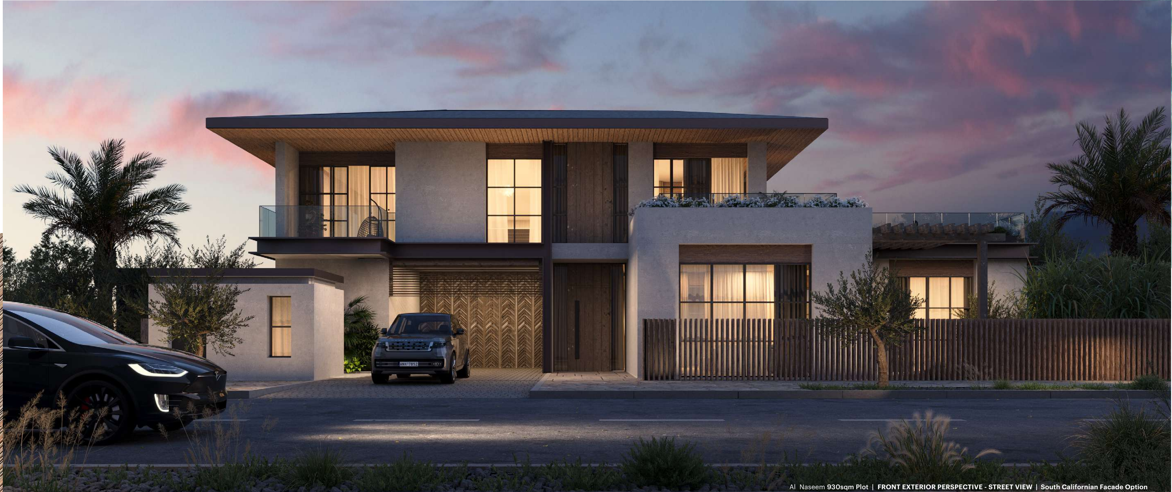
Al Naseem 930sqm Plot | FRONT EXTERIOR PERSPECTIVE - STREET VIEW | South Californian Facade Option