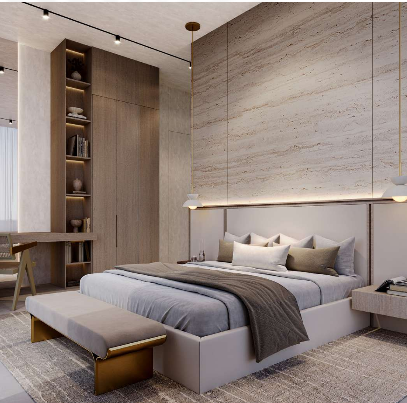
Al Naseem 750m² Plot | MASTER BEDROOM