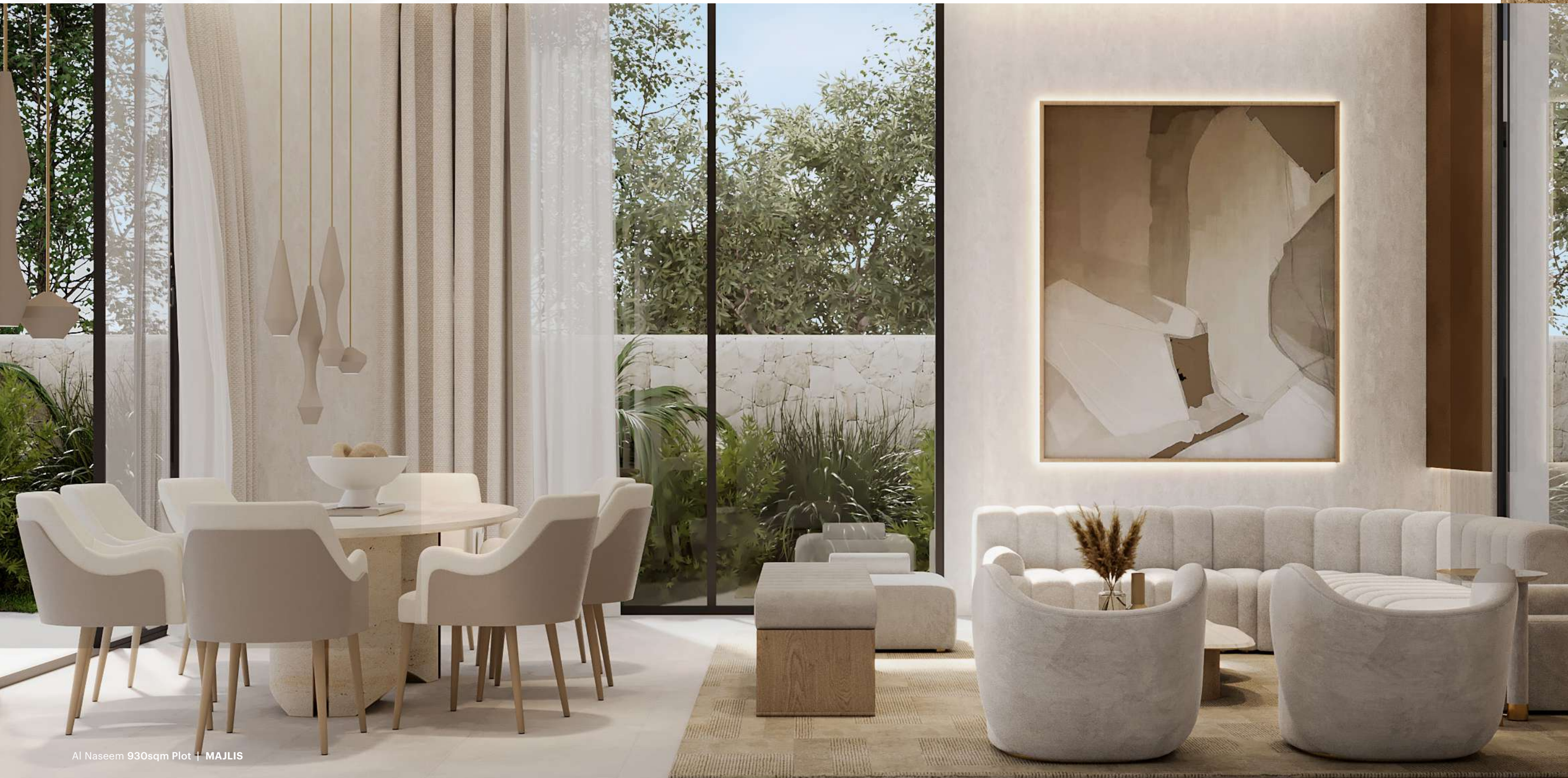
Al Naseem 930sqm Plot | MAJLIS