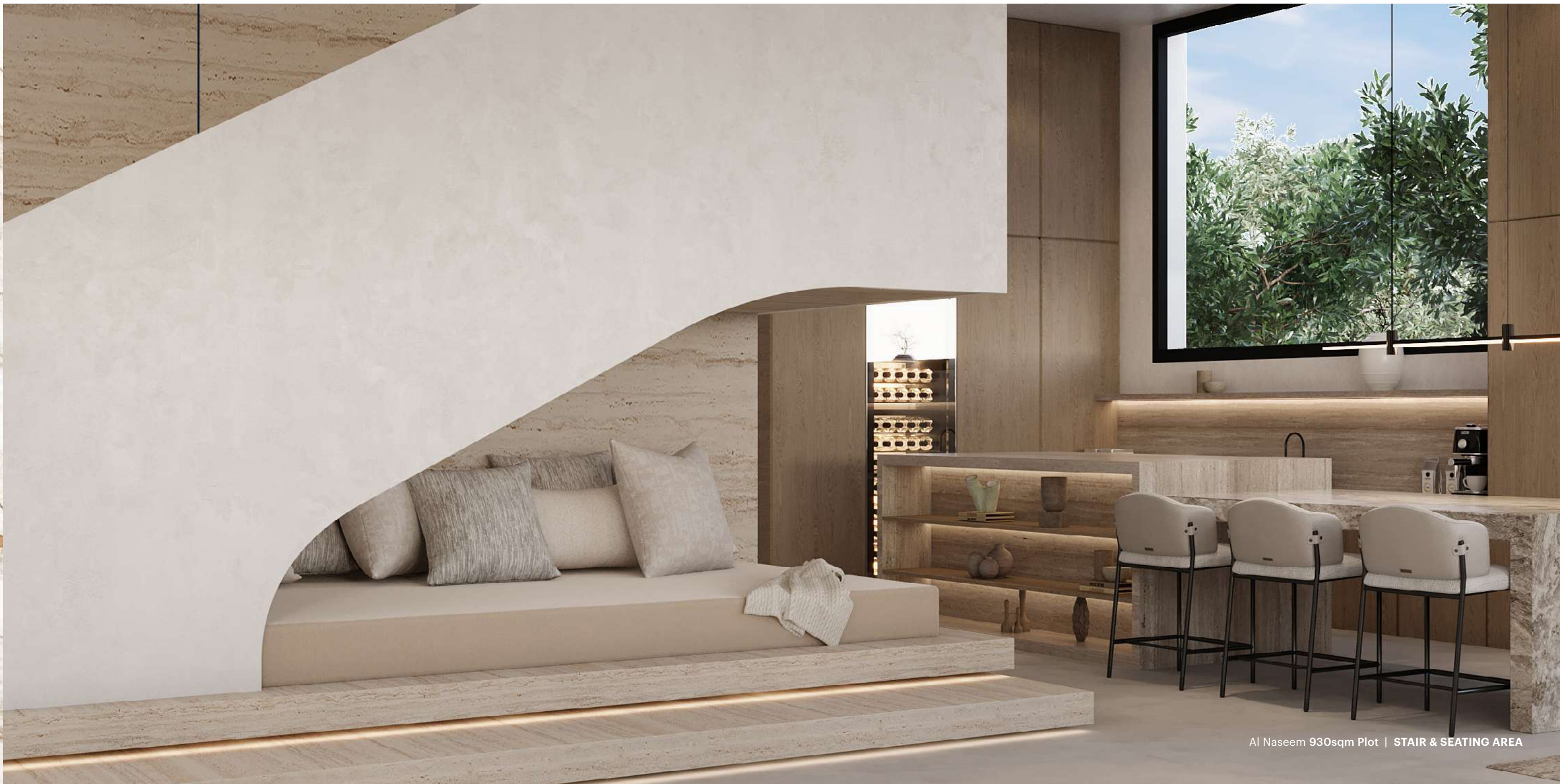
Al Naseem 930sqm Plot | STAIR & SEATING AREA