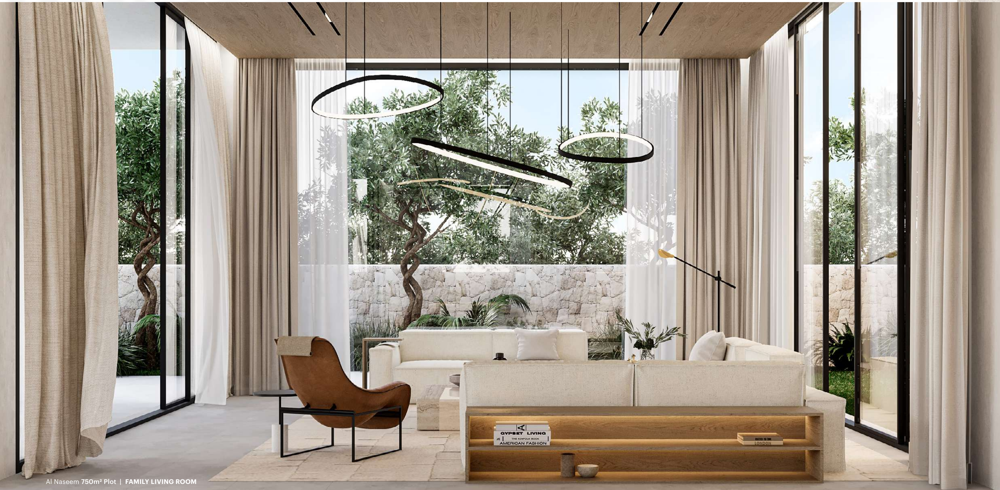
Al Naseem 750m 2 Plot | FAMILY LIVING ROOM