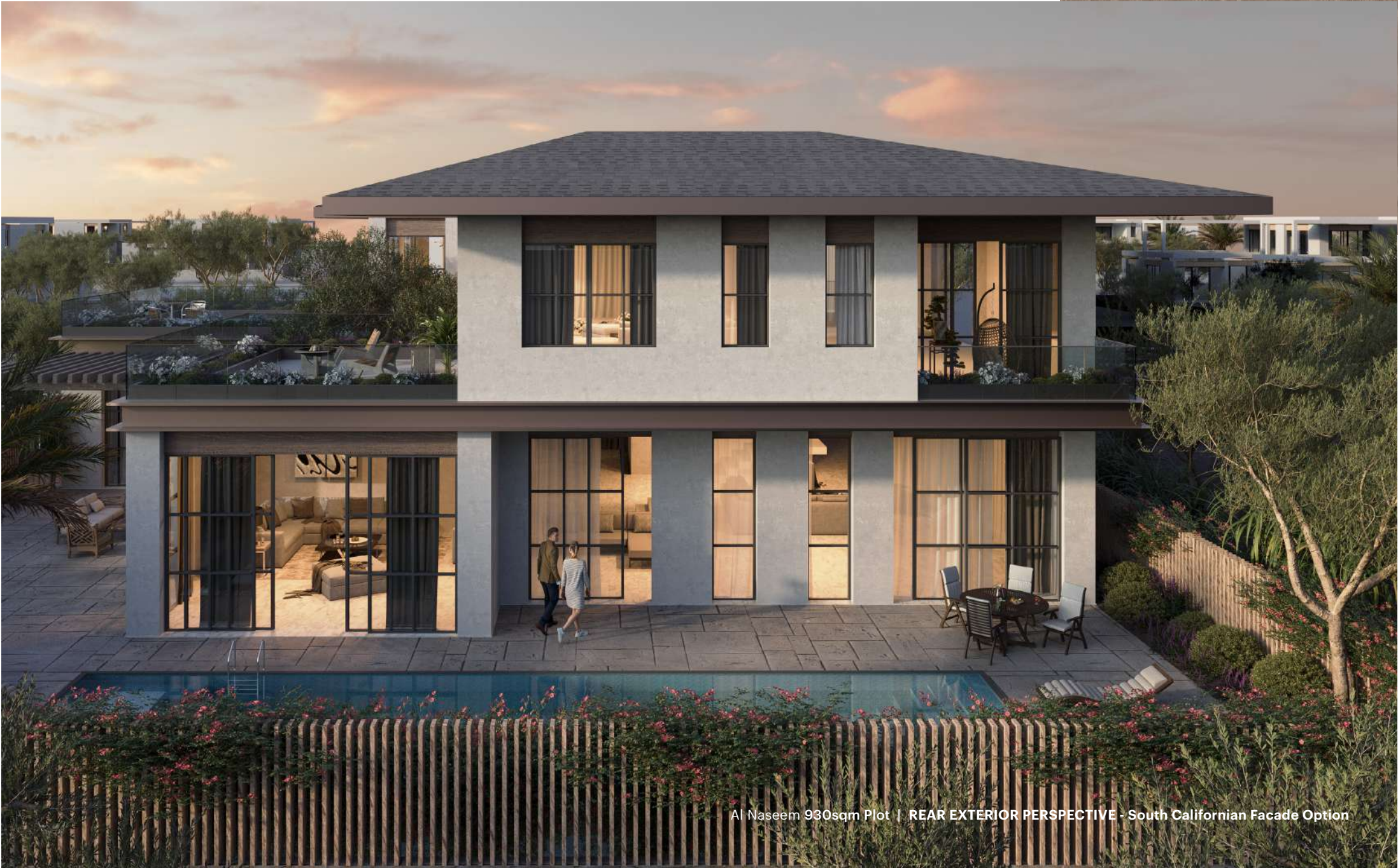
Al Naseem 930sqm Plot | REAR EXTERIOR PERSPECTIVE - South Californian Facade Option

This contemporary style fuses modernity and sociability. Inspired by luxurious modernist architecture, the elevation treatment features a blend of modern and minimalist design elements. It showcases a combination of dark grey metal cornices and white stucco walls. Full-glazed windows are ornamented with timber panels that add an earthy tone. Together with its vast terraces, they connect the interior with the outdoors, creating an inviting and open atmosphere and allowing for a variety of external uses ranging from hosting a dining experience to a yoga session. Pergolas become a key feature of the design providing shade to the bedroom terraces and communal dining experiences in the garden throughout the day.