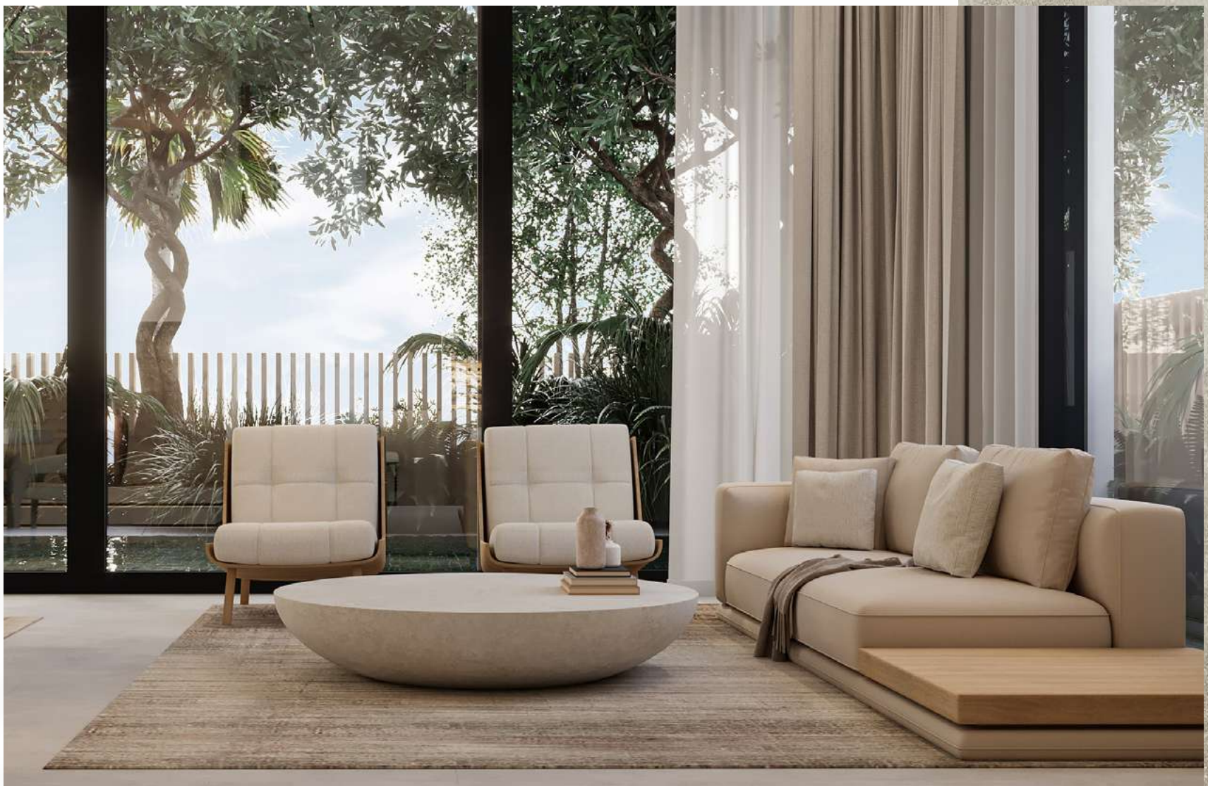
Al Naseem 930sqm Plot | FAMILY LOUNGE