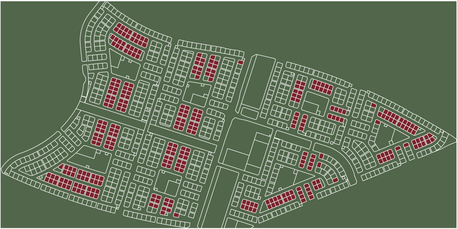
HUDAYRIYAT CENTRAL | AL NASEEM | Plot Locations

Plots suitable for Al Naseem 4 Bedroom Villas